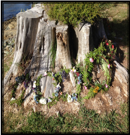
ANZAC Weaths made by people who attended our service

Beautiful wreaths were laid by the big stump.