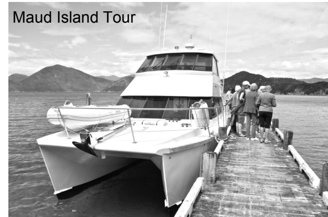
Maud Island Tour